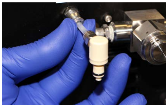
Figure 2 – Removing the Quick Disconnect Insert