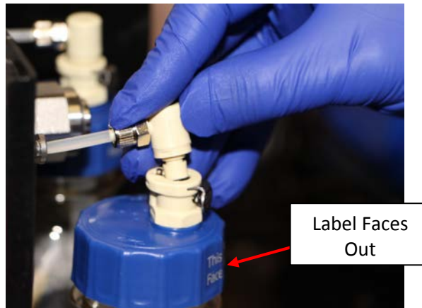
Figure 3 – Connecting the Bottle to the Water Works System